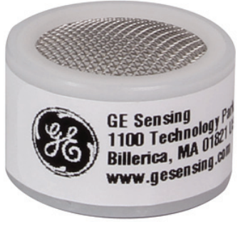
Advanced Galvanic Fuel Cell Sensor

When equipped with optional zener barriers or a galvanic isolator, the oxy.IQ can be mounted in a hazardous (classified) location.